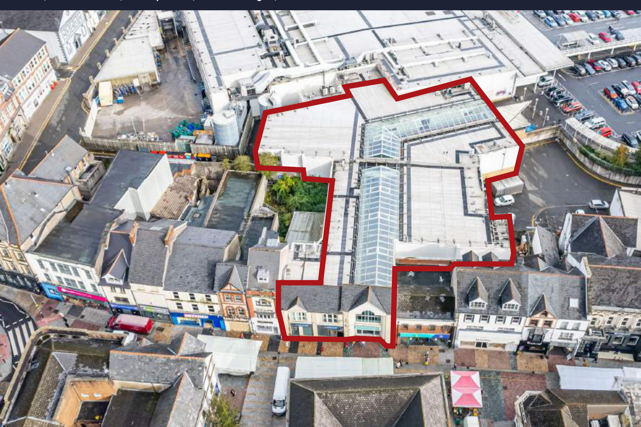
Unit 2, Beacons Place, Merthyr Tidfil, Mid Glamorgan, CF47 8DF